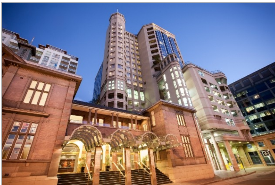
2012 Seminar Venue: The Citigate Central, 169 - 179 Thomas Street Sydney